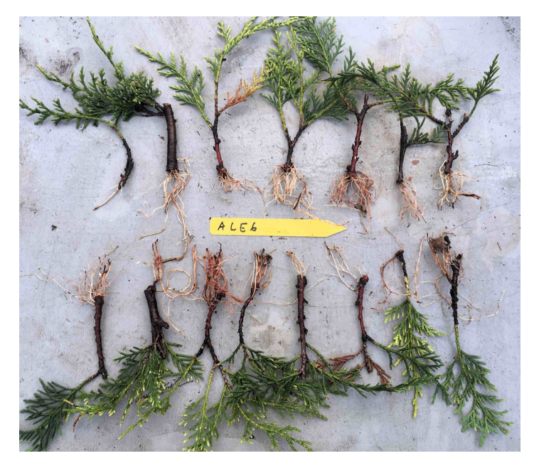
Figure 1. Example of rooted cuttings from foliage of one yellow cedar tree.