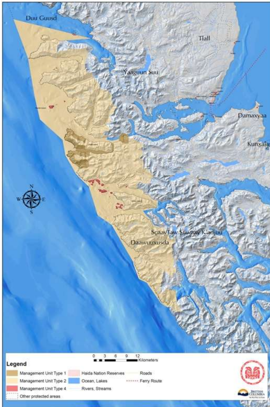
Figure 3. Daawuuxusda Management Zone Map