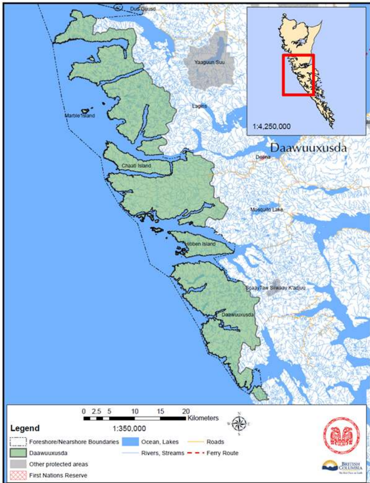
Figure 2. Daawuuxusda Map