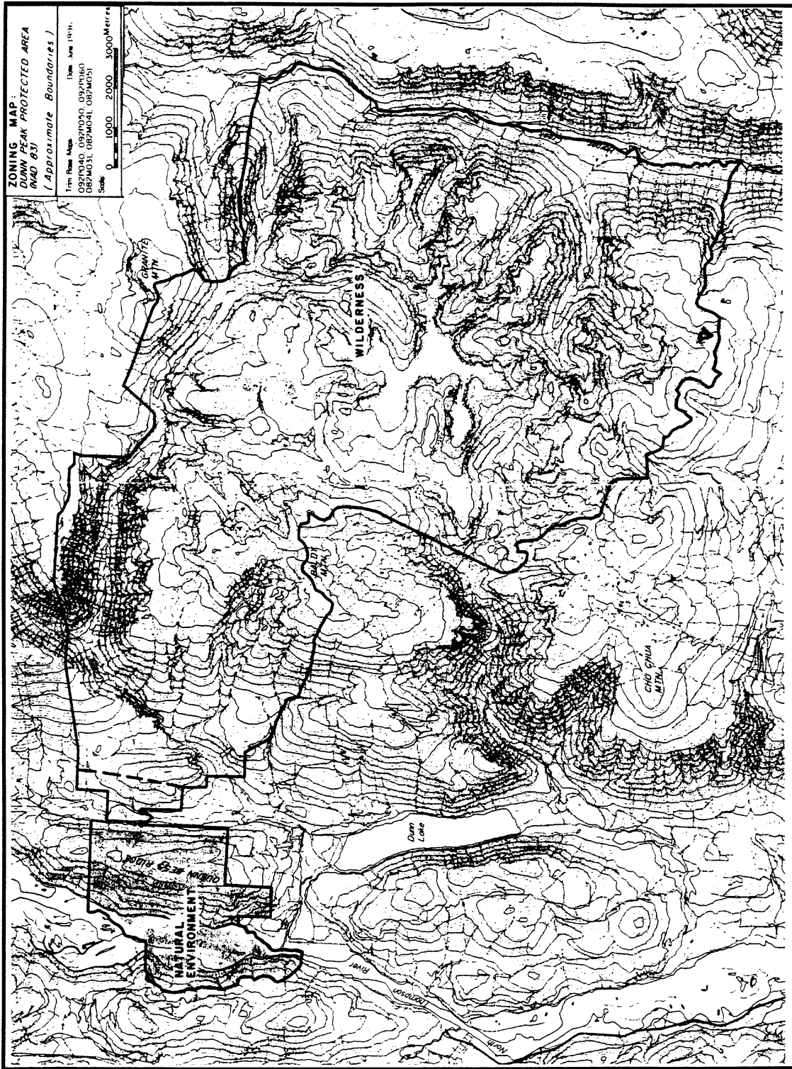
Figure 2 – Zoning Map