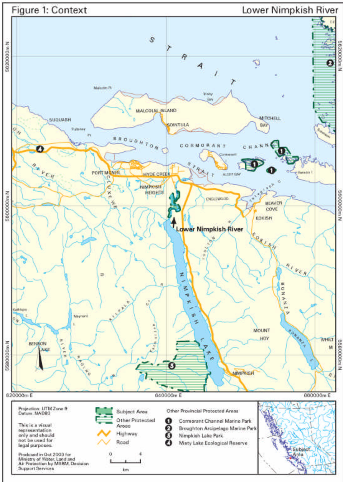
Figure 1: Regional Context Map