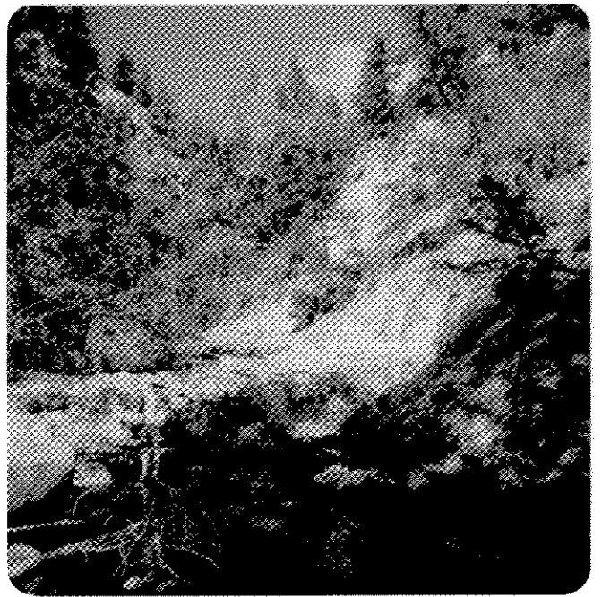
Trout Creek in July.