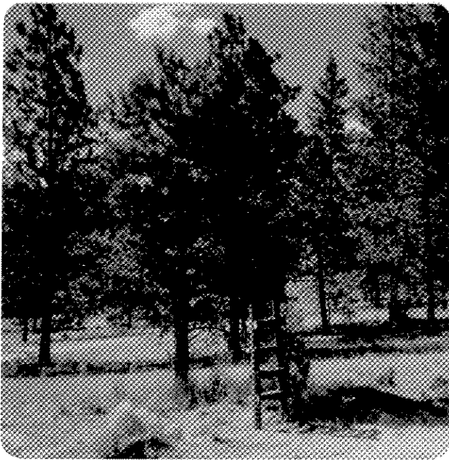
Southeast corner of reserve. (July)