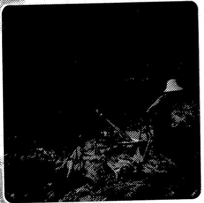
setting the charge on a tripod.