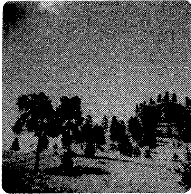
South slope of Conkle Mtn. (June)